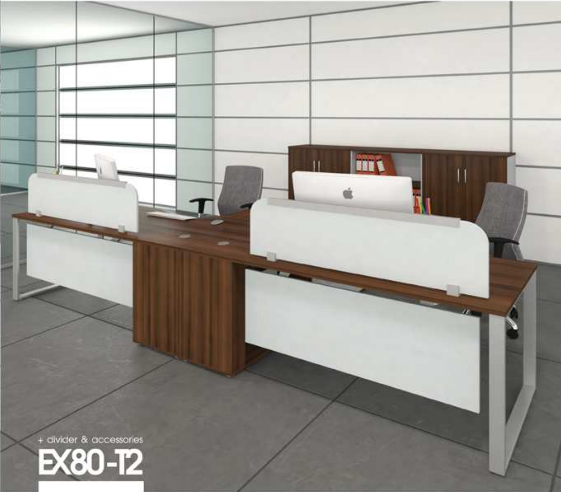
+ divider & accessories EX80-T2