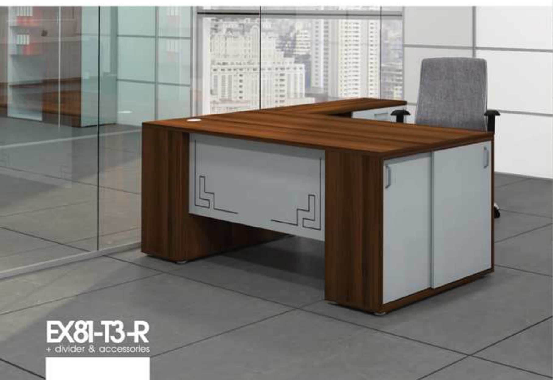
EX81-T3-R + divider & accessories