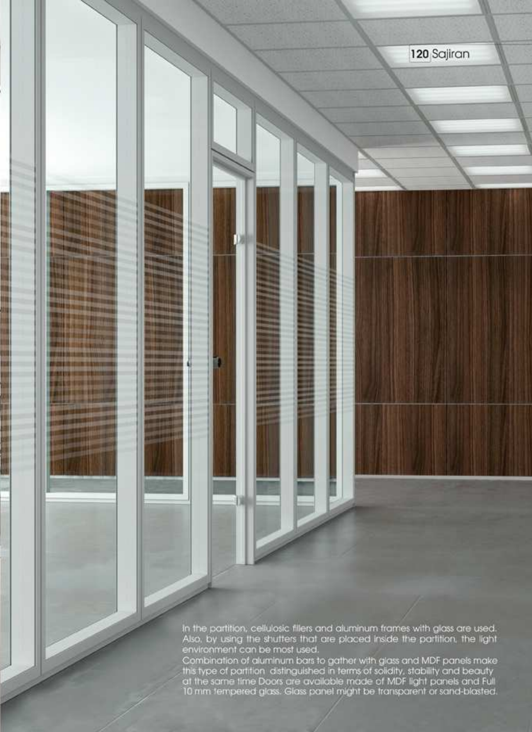
In the partition, cellulosic fillers and aluminum frames with glass are used. Also, by using the shutters that are placed inside the partition, the light environment can be most used. Combination of aluminum bars to gather with glass and MDF panels make this type of partition distinguished in terms of solidity, stability and beauty at the same time. Doors are available made of MDF light panels and Full 10 mm tempered glass. Glass panel might be transparent or sand-blasted.