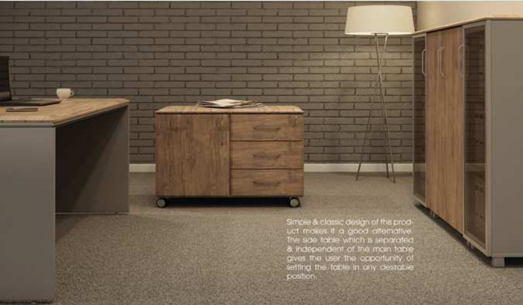
Simple & classic design of this product makes it a good alternative. The side table which is separated & independent of the main table gives the user the opportunity of setting the table in any desirable position.