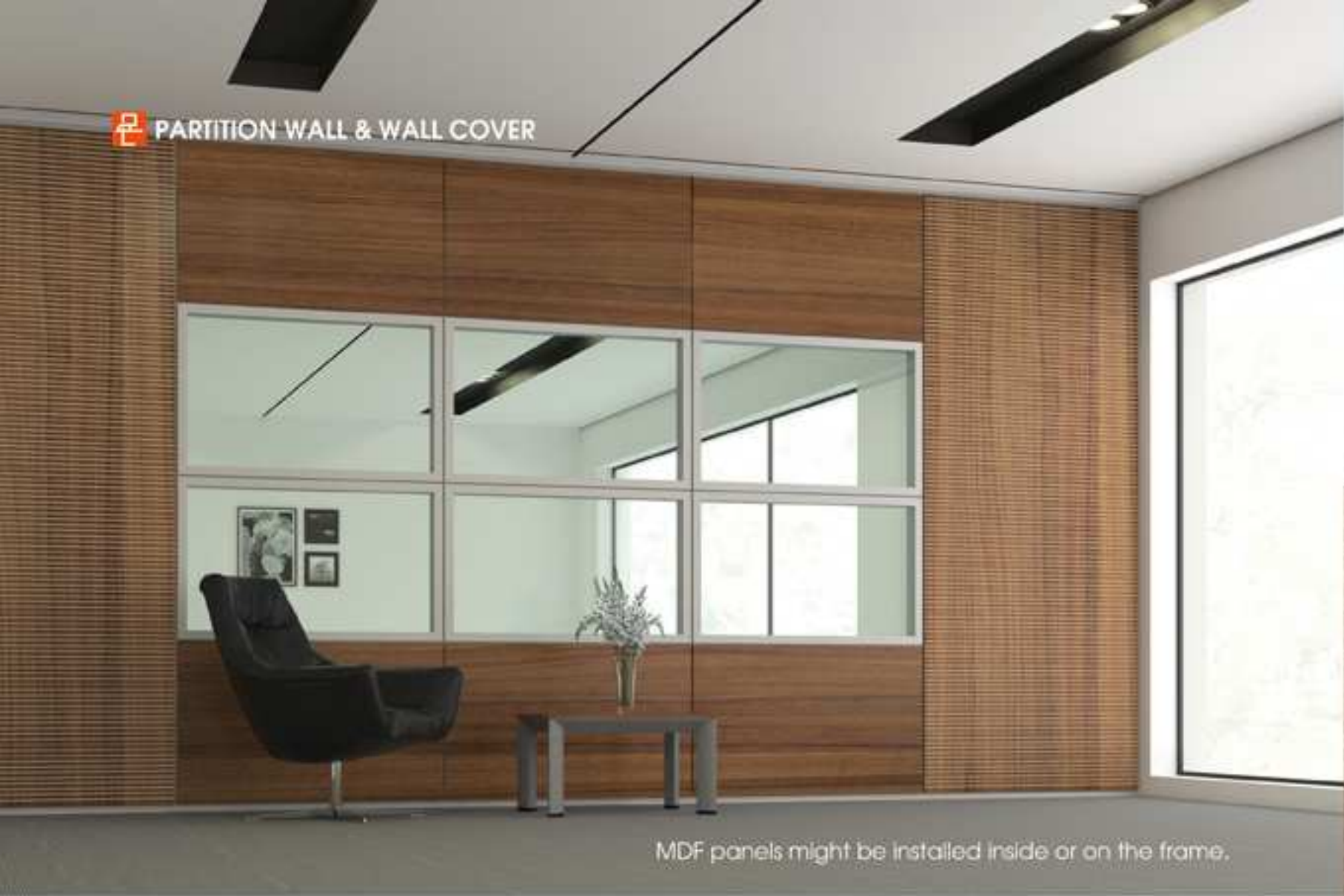
MDF panels might be installed inside or on the frame.