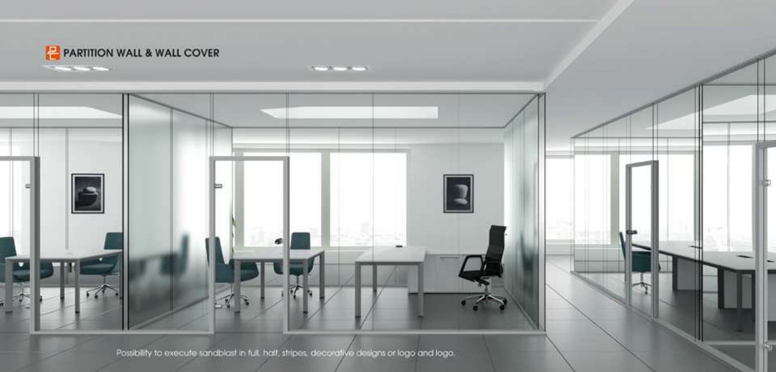
Possibility to execute sandblast in full, half, stripes, decorative designs or logo and logo.