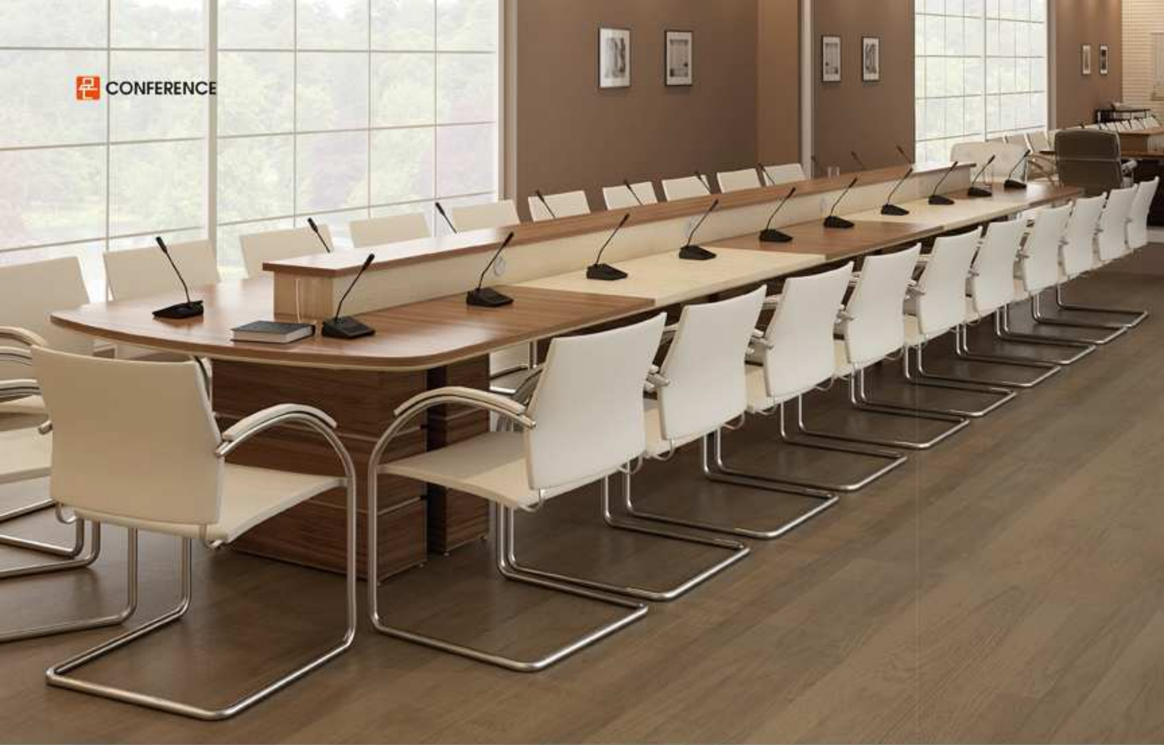
A very glorious and prestigious conference table which is based on a strong structure of metal profile.