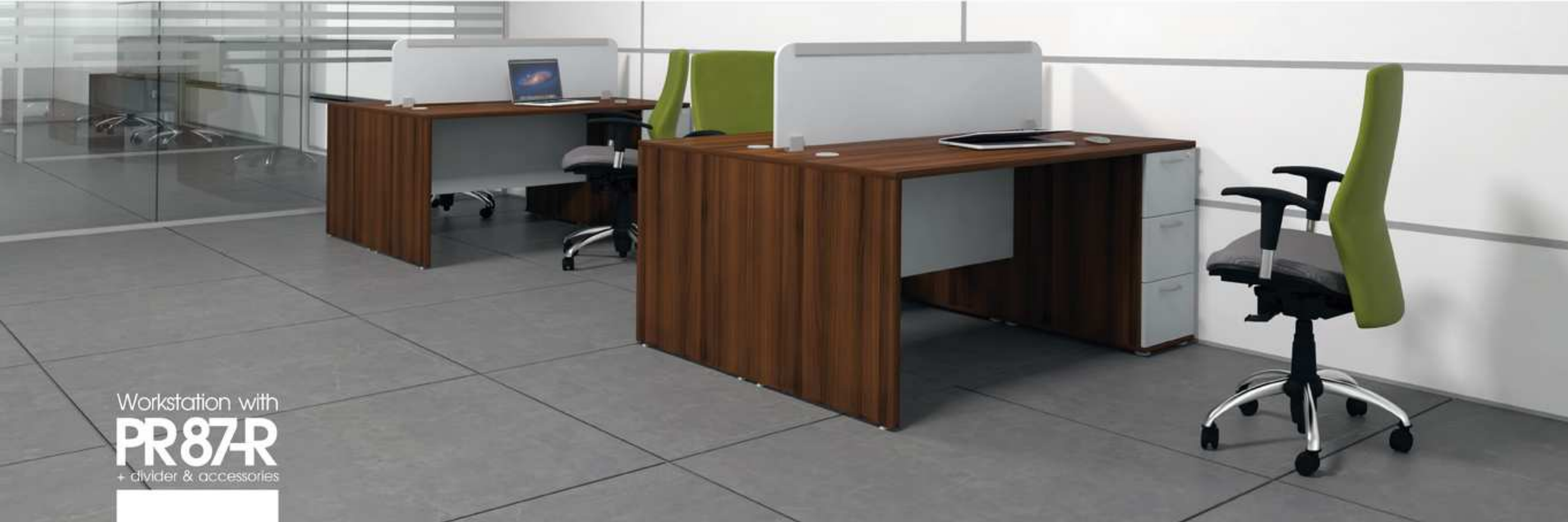
Workstation with PR87R + divider & accessories

These tables with functional and economical design make workplace attractive and regular. Workstation with PR80 and PR87 is designed by taking into consideration all needs of the personals in creating a dynamic work environment.