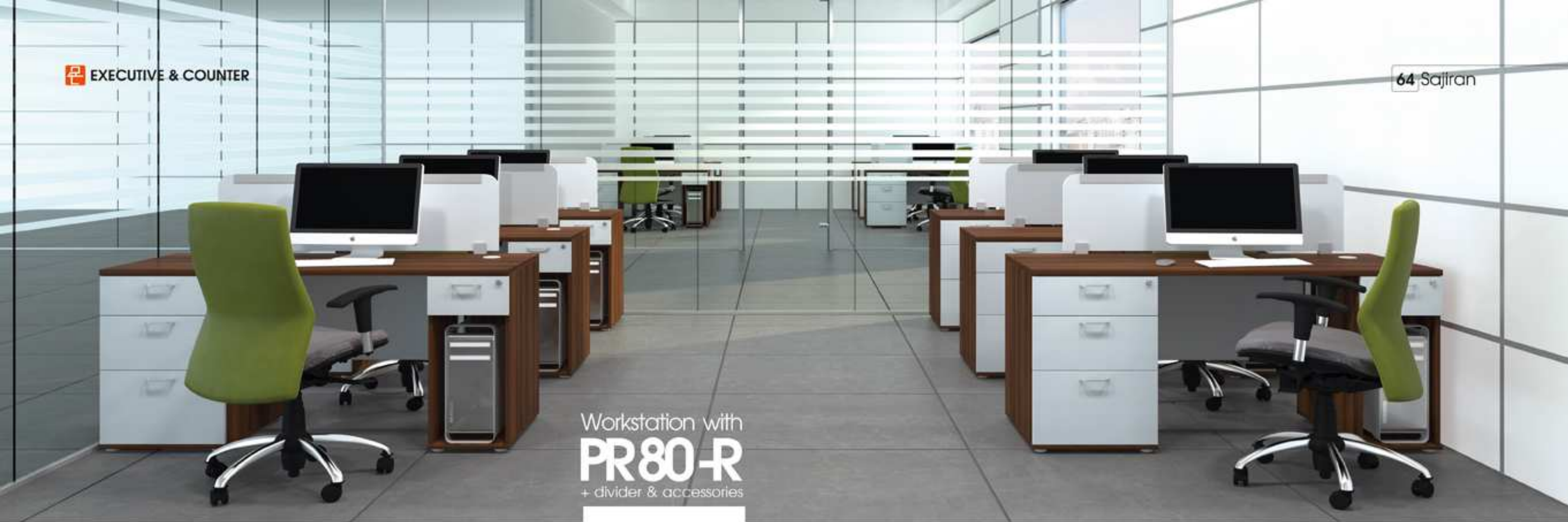
Workstation with PR80-R + divider & accessories

These tables with functional and economical design make workplace attractive and regular. Workstation with PR80 and PR87 is designed by taking into consideration all needs of the personals in creating a dynamic work environment.