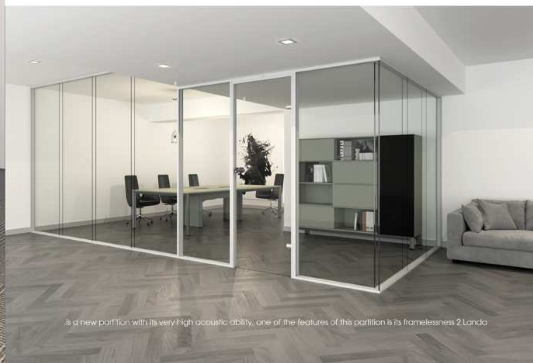
is a new partition with its very high acoustic ability, one of the features of this partition is its framelessness 2 Landa