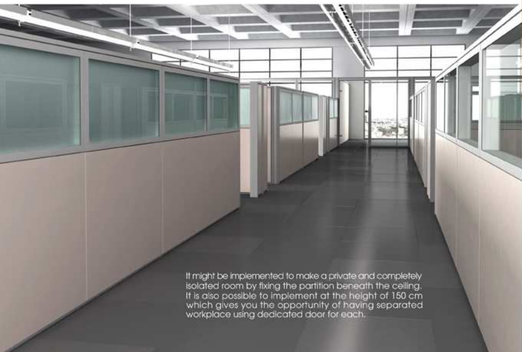
It might be implemented to make a private and completely isolated room by fixing the partition beneath the ceiling. It is also possible to implement at the height of 150 cm which gives you the opportunity of having separated workplace using dedicated door for each.