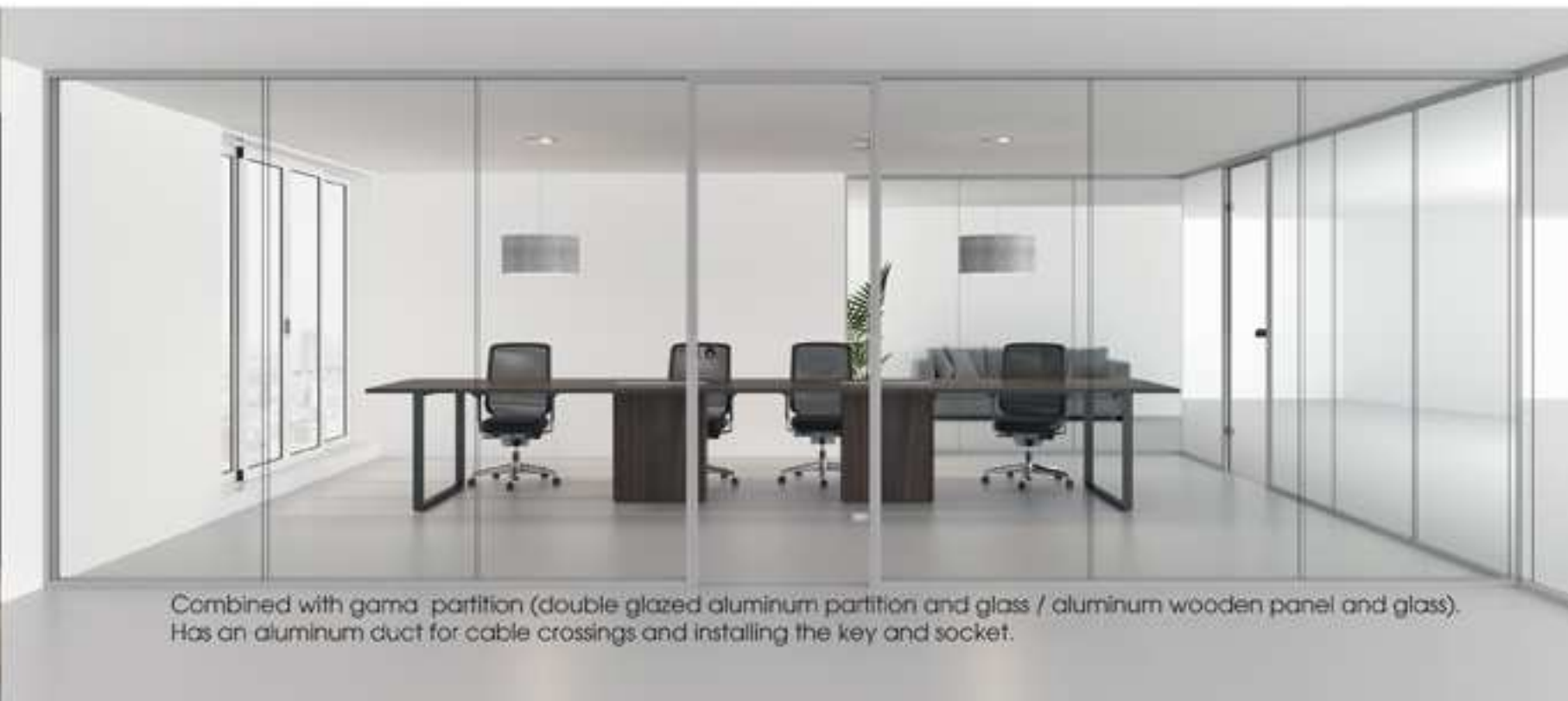
Combined with gama partition (double glazed aluminum partition and glass / aluminum wooden panel and glass). Has an aluminum duct for cable crossings and installing the key and socket.