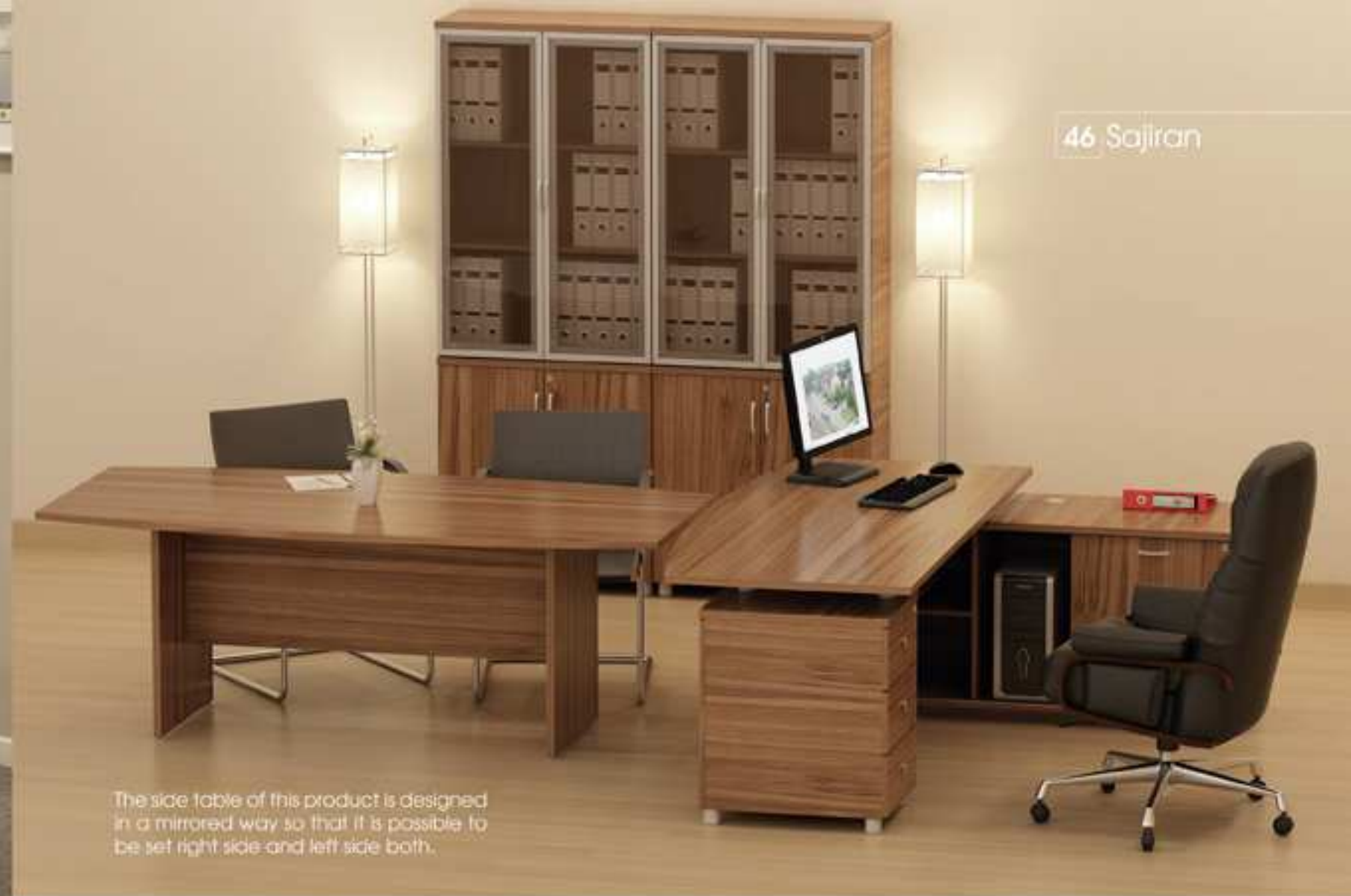
The side table of this product is designed in a mirrored way so that it is possible to be set right side and left side both.