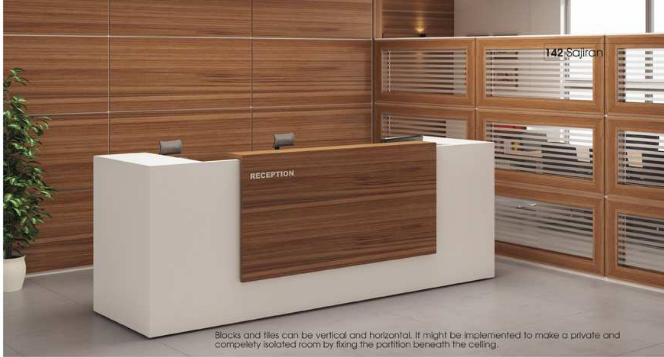
Blocks and tiles can be vertical and horizontal. It might be implemented to make a private and completely isolated room by fixing the partition beneath the ceiling.