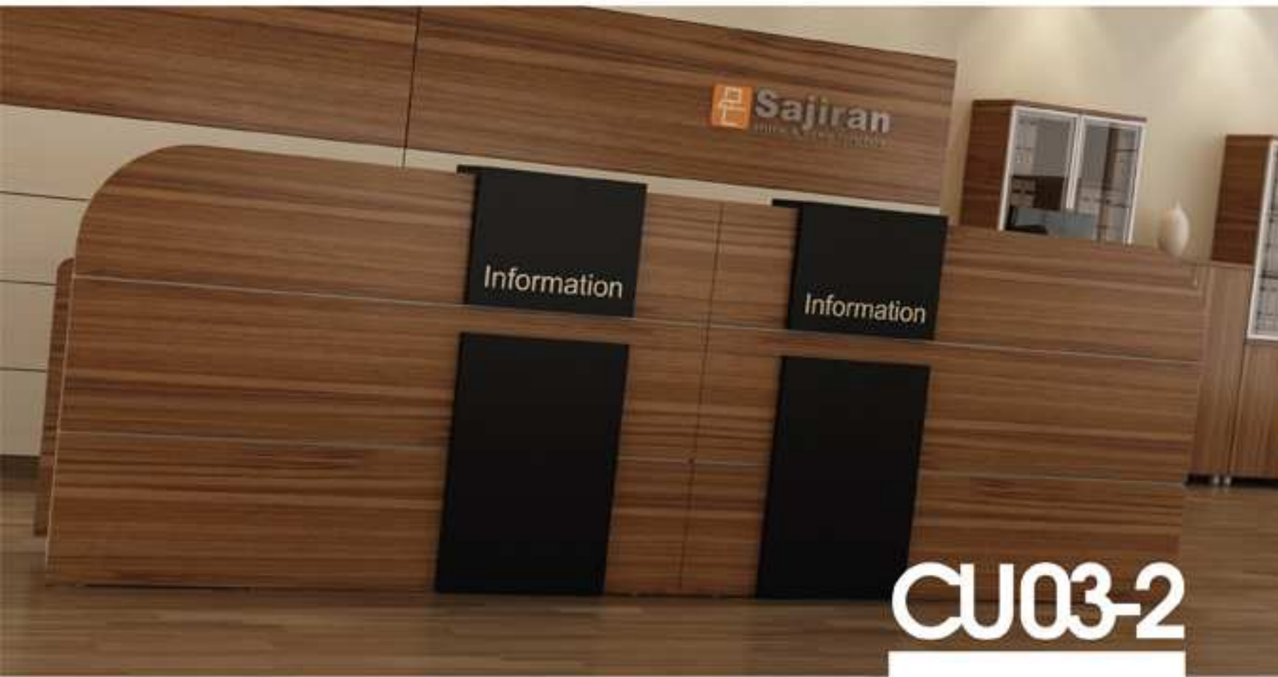
Every detail has been studied through designing this information desk. The product is capable to be offered for two and three persons.