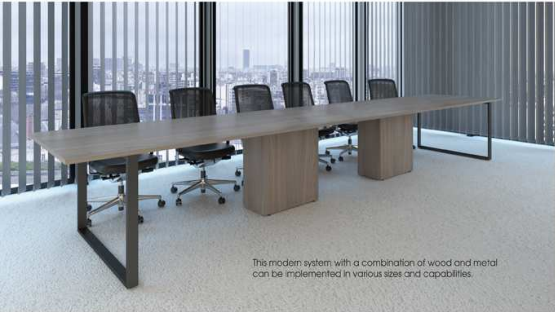
This modern system with a combination of wood and metal can be implemented in various sizes and capabilities.