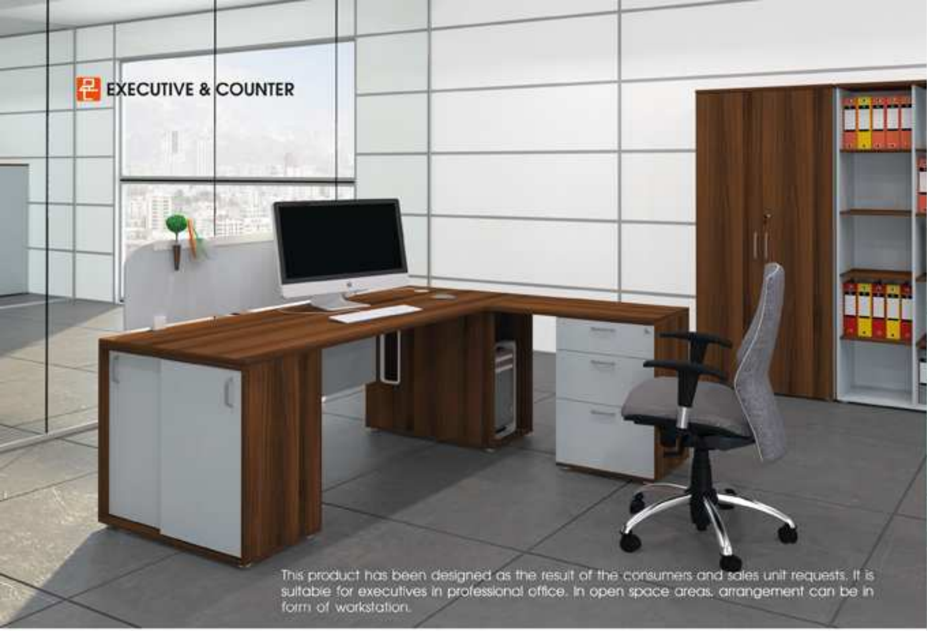
This product has been designed as the result of the consumers and sales unit requests. It is suitable for executives in professional office. In open space areas, arrangement can be in form of workstation.