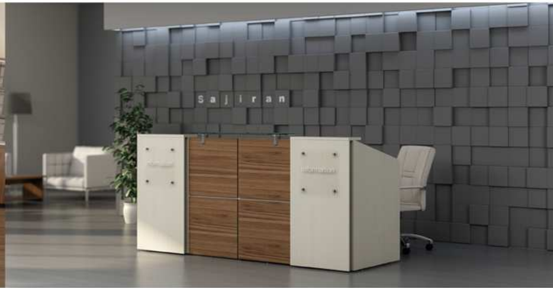
A well-designed counter using glass, aluminum & melamine-coated. Side table is includes a cabinet & a set of drawers. A divider along the table provide each user with a special private area.